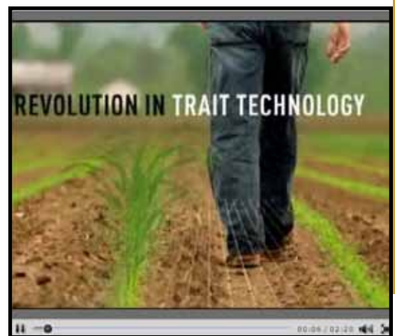
Example of a pre-roll