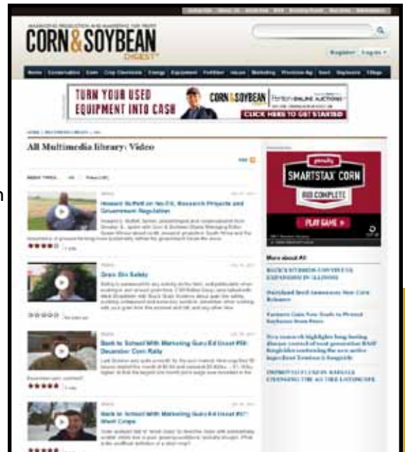
CSD Live homepage

Check out Video Pre-Rolls at CORNANDSOYBEANDIGEST.COM/TV